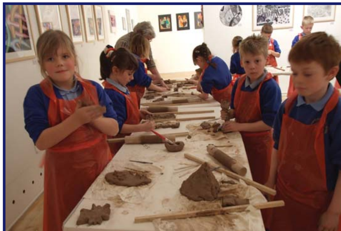
Young people participating in one of the STart workshops

Funded by Community Foundation of Merseyside.