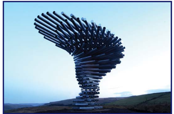
'Singing Ringing Tree'