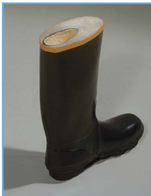
Guide by Richard Wentworth

Mapping the Terrain presents a range of art works specially selected from the Arts Council Collection on the theme of changing landscapes. The thesis links in with the unique and ambitious arts and regeneration programmes Panopticons and Land, co-ordinated by Mid Pennine Arts, which aim to change perceptions of East Lancashire by attracting visitors to the area to appreciate its wonderful panoramic landscapes. The exhibition brings together sculpture and works on paper by artists investigating subjects of walking, mapping and taking a journey.