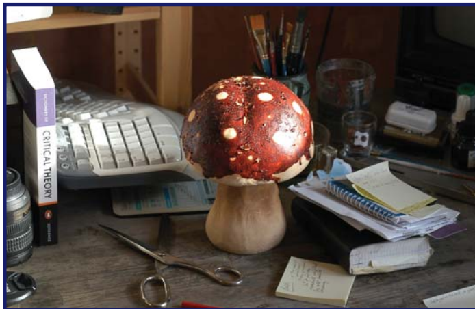
Art Bloodied Thought

Mid Pennine Gallery 18th August - 13th October 2007