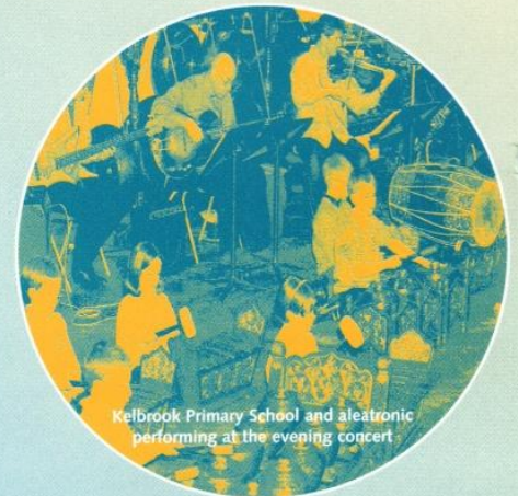
Kelbrook Primary School and aleatronic performing at the evening concert

A second series of music and art workshops will take place during June/July in Rossendale, full details on page two under Summer Term.