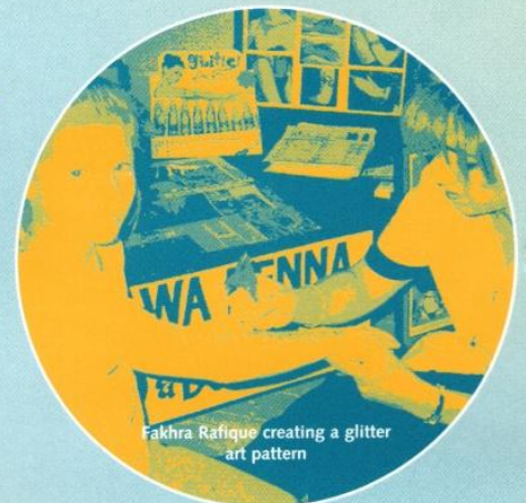
Fakhra Rafique creating a glitter art pattern

Please encourage your students to join in extra activities at weekends and holidays.