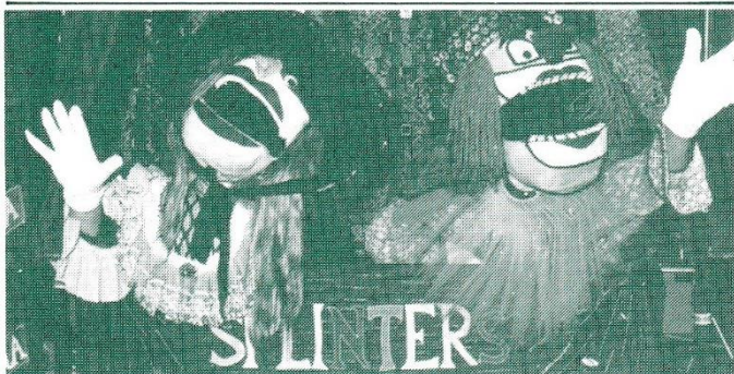
Margot the Magnificent and Boring Boris: Mermaid Puppet Theatre.

Wednesday 6 October, 7.30 pm Town Hall, Accrington