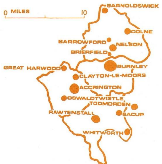
Districts which contribute to the Mid-Pennine Association for the Arts

Check posters and press for full details of ticket outlets.