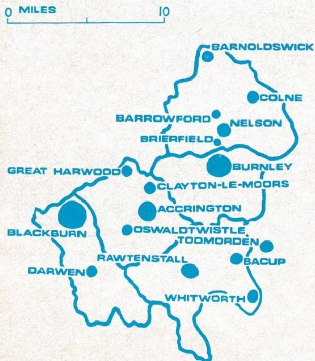
Districts which contribute to the Mid-Pennine Association for the Arts

If you like what we are doing, tell your local councillor or write to your local paper, Or contact us at Hammerton Street.