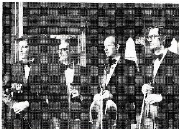
GABRIELI STRING QUARTET

The GABRIELI STRING QUARTET makes a welcome return appearance to the area on the 10th November. They are already established here as an outstanding ensemble, and it may be of interest to know that several recordings of theirs has just been released by Decca. The programme they will perform at Burnley Central Library is Haydn's Quartet Op. 76 No.3 ("The Emperor"), Tchaikovsky's Quartet No.1 in D, and Beethoven's Quartet Op. 59 No.3