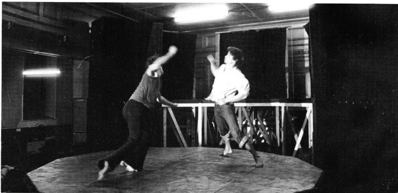
A scene from Macbeth in rehearsal

There will also be a super new children's show – so remember to watch out for TheatreMobile shows in your area.