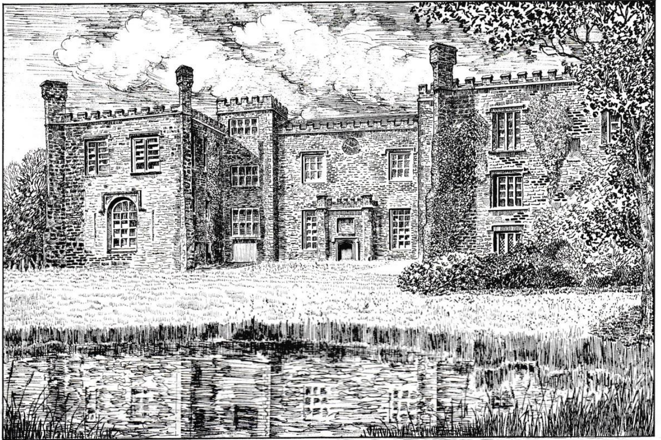
TOWNLEY HALL, BURNLEY.