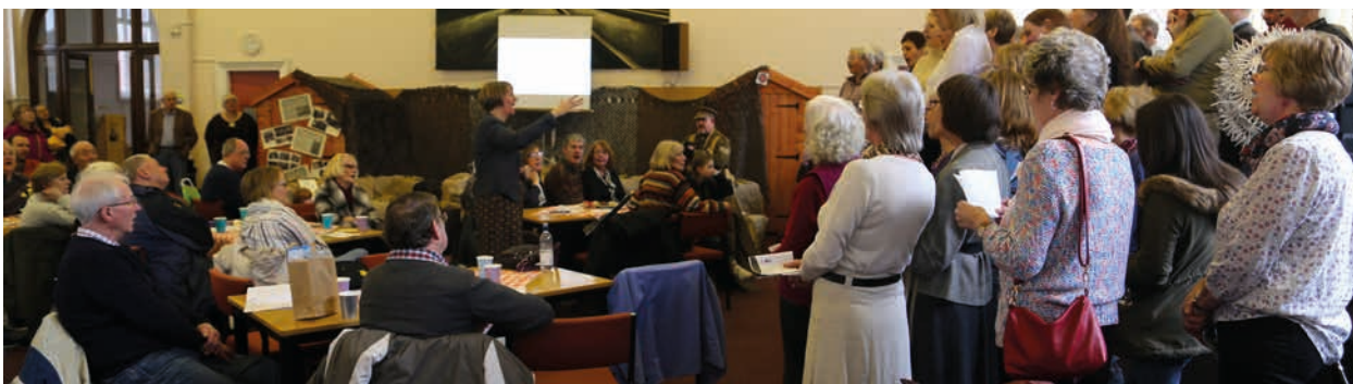
165 people came together at Return to No Man's Land