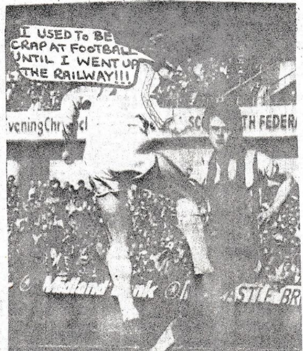
The Railway, Nelson - definitely recommended