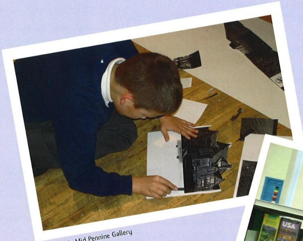
Workshop in Mid Pennine Gallery