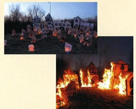
Whitefield children recreate the Great Fire of London bringing history and science together as they explore how materials are changed by heat.