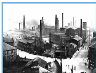
Weavers' Triangle, 1910