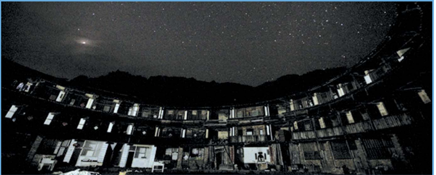
Interval II still. Suki Chan