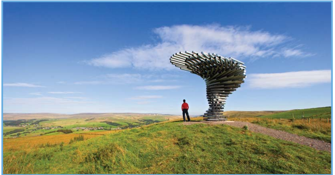
Singing Ringing Tree

To find out more about this project see inside the newsletter.