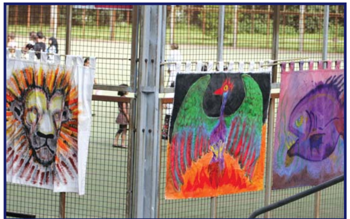
Banners decorated the music area

It is hoped that next year we will be back in our spiritual home of Oakhill Park after the work has been completed on the bandstand.