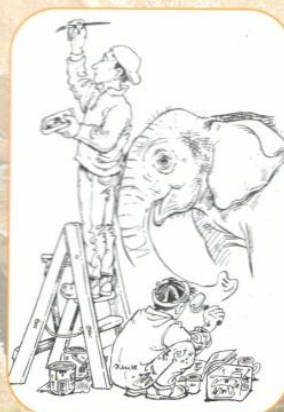
The Picture House

Two freelance illustrators with over 30 years combined experience of working with top publishing houses from Oxford and Cambridge Press to Faber and Heinemann as well as many more obscure ones! They are developing a reputation for their colourful and imaginative mural work and have recently completed a commission at Haslingden Primary School. Suitable for KS 1, 2 and 3.